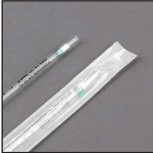
1720 - Sterile, individually wrapped