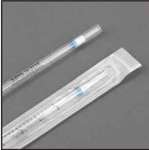
1740 - Sterile, individually wrapped