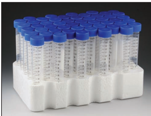
Item# 6286 in 50 place rack