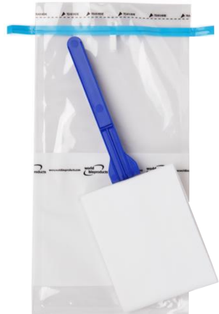
EZ Reach™ 8X

EZ Reach™ sponge sampler is ideal for collecting samples from areas up to 2 ft 2 . Yet sometimes you need something bigger. The new EZ Reach 4X and EZ Reach 8X devices provide a more efficient and effective way to sample larger surface areas of up to 8 ft 2 and 16 ft 2 respectively. All EZ Reach sponge samplers are available dry or pre-hydrated with various collection solutions.