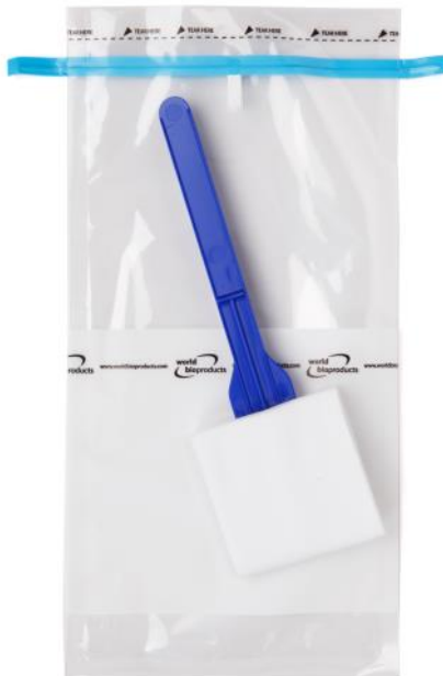
EZ Reach™ 4X