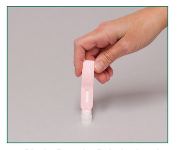
Dip the Reveal 3-D device into the liquid in the lid; ensure that the cavity is saturated with the liquid.