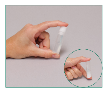
Secure cap and shake for 1 minute.