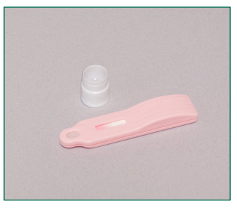
Place the device on a flat surface and allow the test to develop for 5 minutes.