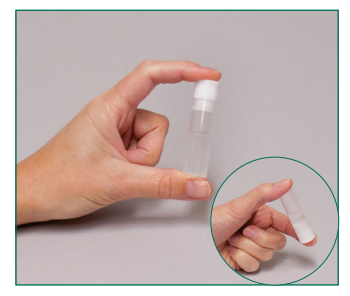
Secure cap and shake for 1