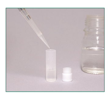
Add 0.25 mL of sample to the sample tube.