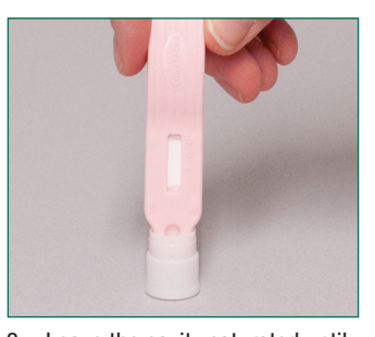
Leave the cavity saturated until the liquid is seen running into the test window.