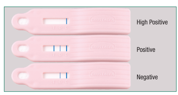
5. Interpret the results.