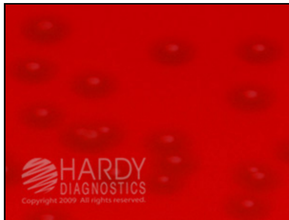
Streptococcus pneumoniae (ATCC® 6305) colonies growing on Blood Agar, 5% Sheep (Cat. no. A10). Incubated in CO 2 for 24 hours at 35°C.