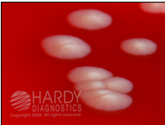
Escherichia coli (ATCC® 25922) colonies growing on Blood Agar, 5% Sheep (Cat. no. A10). Incubated aerobically for 24 hours at 35°C.